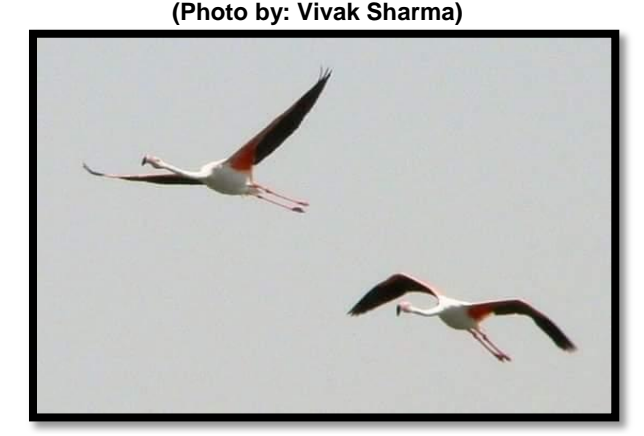
Fig 4 Two adult Greater Flamingo Phoenicopterus roseus fly over Anasagar lake

VOL-3* ISSUE-6* September- 2018 Remarking An Analisation