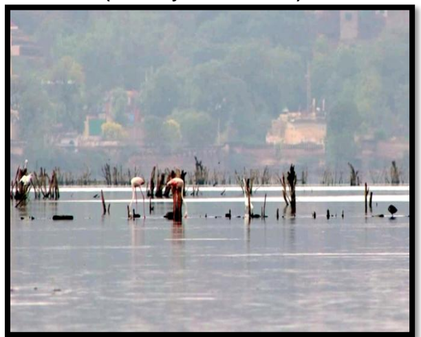
Fig 2 Two adult Greater Flamingo Phoenicopterus roseus feeding in Anasagar lake

Flamingo were not reported at Anasagar lake in 2016-2017 yearly censes organized by forest department of Ajmer Rajasthan but choose Gundolav lake in Kishanghar district as their resting sites